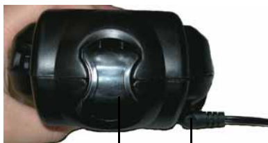
Figure 2 Latch Power Port